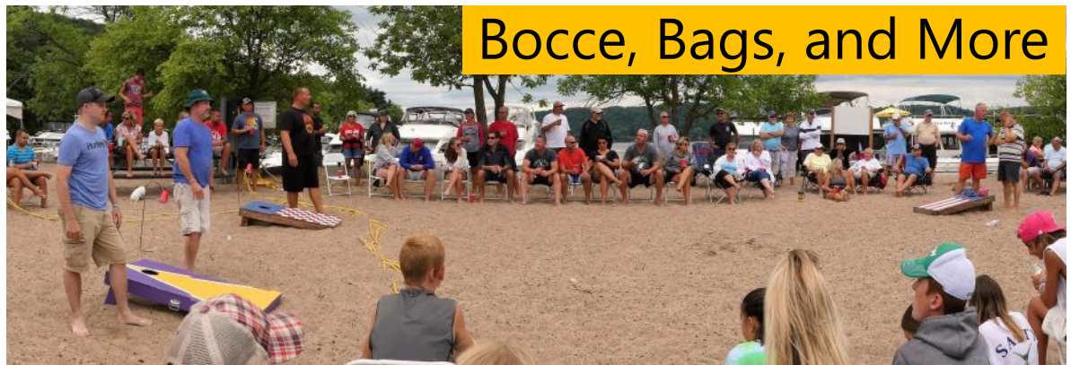
Bocce, Bags, and More