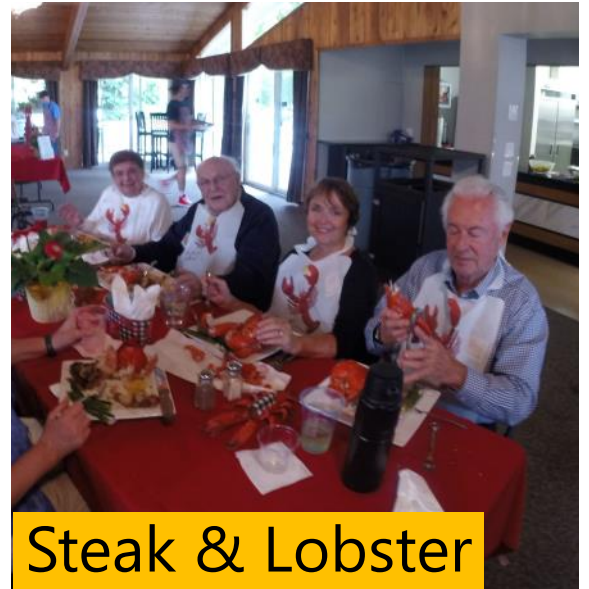
Steak & Lobster